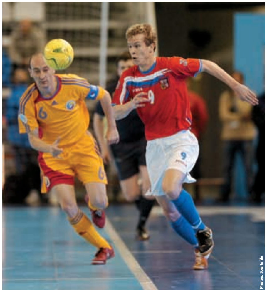
Romania v Czech Republic in action in Group A.

team was awarded a corner kick and it took 12 to 15 seconds for the ball to be placed and the player to roll the ball into play. That, for the TV spectator, sows the seeds of boredom. And the same applied to kick-ins. The referee might start counting seconds once the ball is placed – but how long did it take to place the ball? If we give them four seconds to get the ball into play, should we give them a maximum of six seconds preparation time? I think a total of ten seconds is reasonable in a sport which is renowned for the speed of its match action. I know we are guaranteed 40 minutes of play but, if you look at the statistics for real playing time in Portugal, you can easily calculate how much time was lost. In some cases, it was so much that the teams playing the second match of