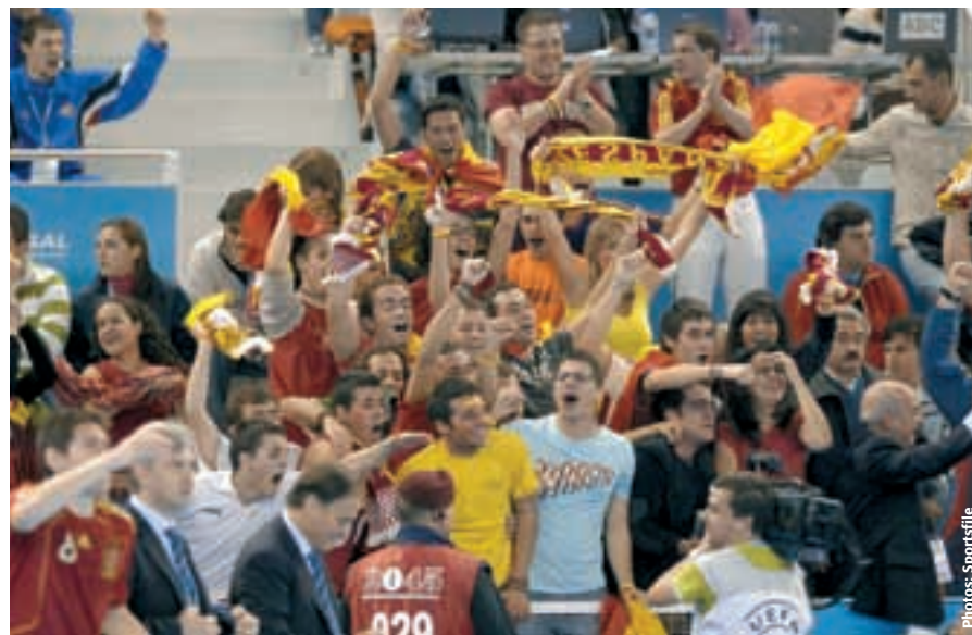
A large and enthusiastic crowd attended the final of the European Futsal Championship.

point of view because they have much more contact with the ball. That's why football clubs have become aware of the value of futsal in youth development. We have futsal teams from early ages and a national league at youth level as well as regional competitions, from which the champions go on to dispute the Spanish championship. At all age levels. In terms of representative selections, there's a similar situation, as teams from all the autonomous regions compete for the national title. In every age bracket right down to Under-10s."