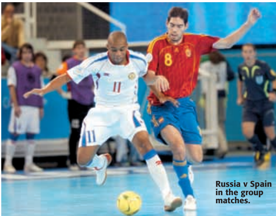
Russia v Spain in the group matches.

"I was also surprised by the minimal use of the flying goalkeeper. I saw situations where I thought the Czech Republic, Romania, Serbia or Ukraine would have used this option. It was a major surprise – especially as, in Spain, we are very much accustomed to seeing this strategy. In our league, almost all matches end with one team using five outfield players – unless it's a draw that suits both teams. Otherwise, the losing team always takes off the goalkeeper and sends on the extra outfielder. It's a facet of the game that we focus on a great deal during training. We are aware that it's an important element within the game and that we're talking about handling potentially decisive phases of play. It's a very important option and a key element in futsal. That is why I was totally surprised to see it used so infrequently in Portugal."